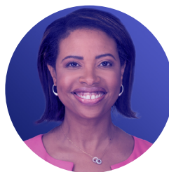
Chiquita Brooks-LaSure Current CMS Administrator