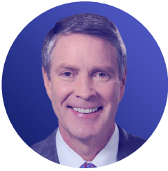
Senator Bill Frist, MD Former Senate Majority Leader; Founder, Frist Cressy Ventures