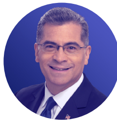
Xavier Becerra Current HHS Secretary