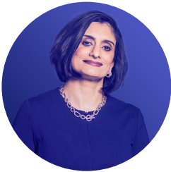
Seema Verma, MPH Consultant and Former CMS Administrator